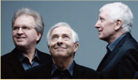
Hilliard